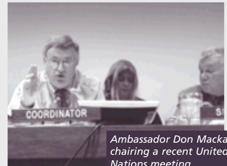
Ambassador Don Mackay chairing a recent United Nations meeting.

Rights Commission and Inclusion International. The sixth meeting of the committee will take place from 1 to 12 August 2005. Read more at http://www.un.org/esa/socdev/enable/rights/adhoccom