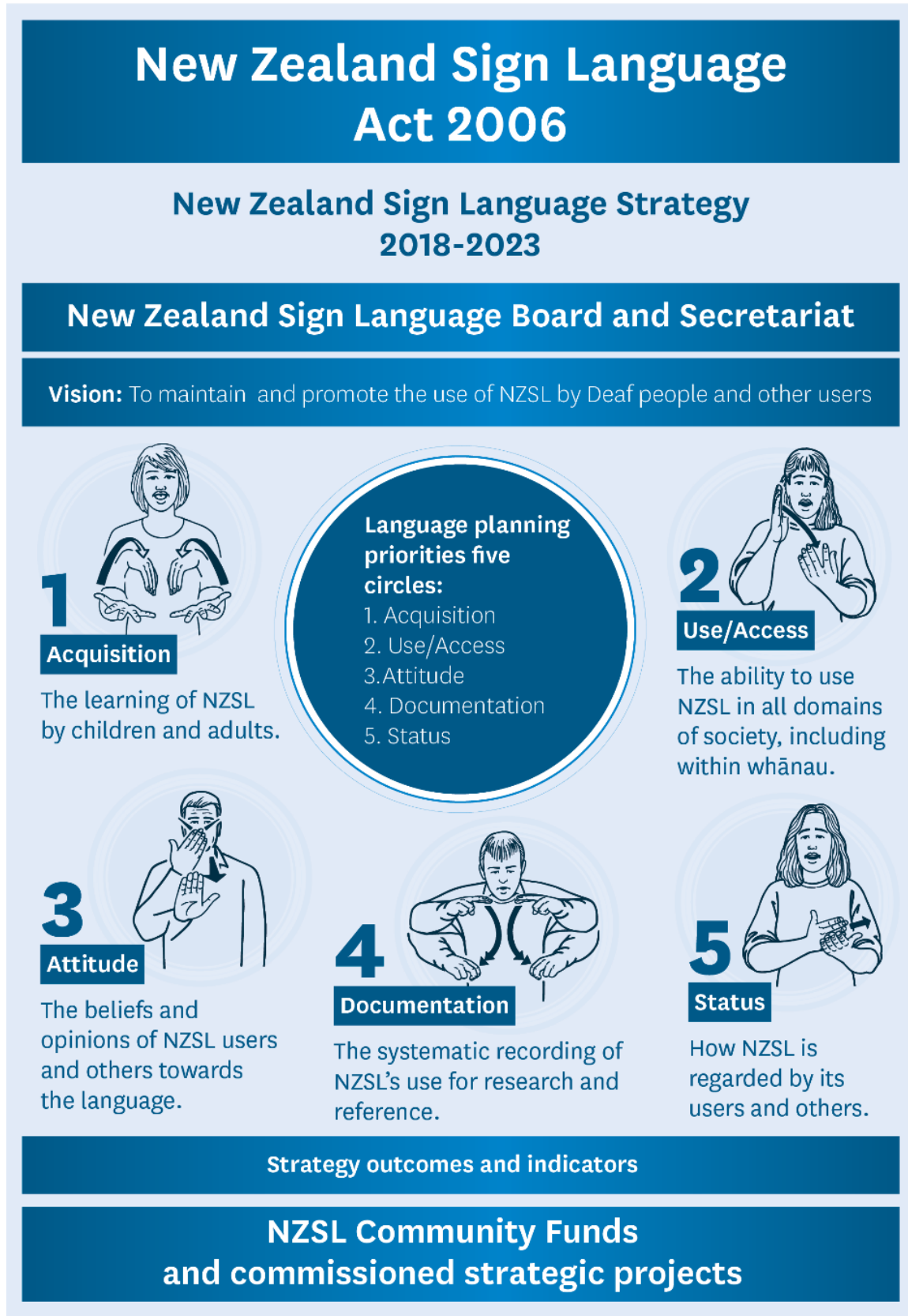
Figure 2: The relationship between the NZSL Act 2006, the NZSL Strategy 2018-2023, the NZSL Board and its Secretariat